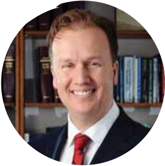
PAUL LEFEBVRE Mayor of Greater Sudbury

The theme of the 2023 season weaves itself throughout the partnership between YES Theatre and the Sudbury Theatre Centre.